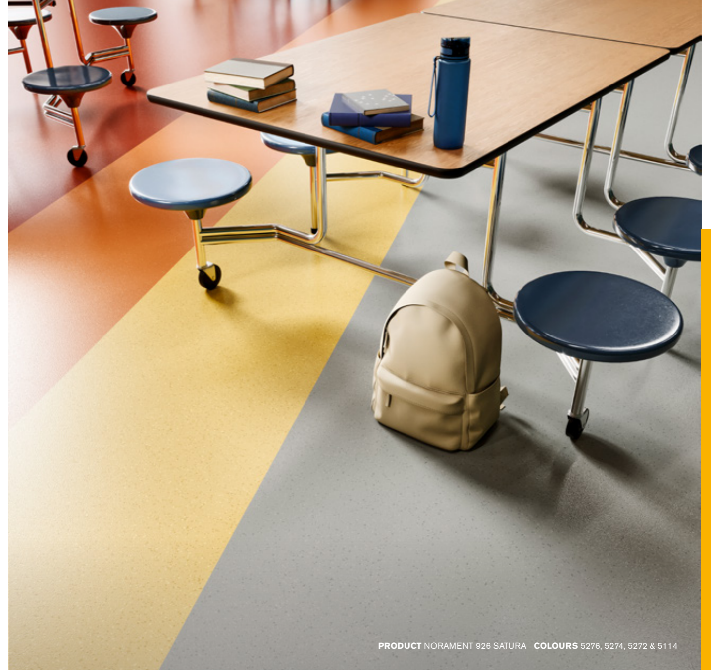
PRODUCT NORAMENT 926 SATURA COLOURS 5276, 5274, 5272 & 5114